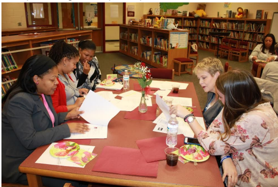
Education Excellence Committee

Education Excellence: This committee is hoping to expand our program for helping beginning teachers in Franklin County. They would like to participate in the New Teacher Orientation to help make us more visible for new teachers who would benefit from veteran teachers support. They would like to provide the beginning teachers with names of member who can support them. The committee is also planning to help keep our Gamma Tau sisters informed with new education legislations from the state government.