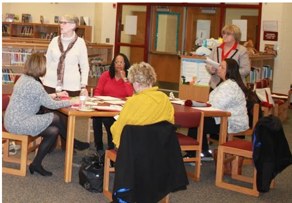
Grant in Aid and World Fellowship Committee

Grant in Aid and World Fellowship: This committee main goal is to enlarge our White Elephant sale we have every December. The profits from our white elephant sale go towards our scholarship we provide for a classified employee. Their goal is to be able to provide a larger scholarship to that recipient.